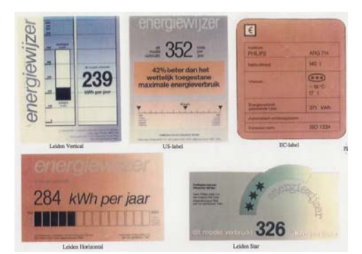
Figure 1. The first five label designs including the old EC label.

The designs were tested in a twin experiment. In the first round, 75 people were each shown the five labels for one minute individually via slides. Questions were posed through a standard tape recording. Labels were shown in a strict rotation so each label was equally seen first, second, third, etc. Respondents evaluated the labels for seven parameters on an 11 point bi-polar scale. Responses were then grouped to give scores for four major parameters: comprehension, salience, information and appeal. The difference in average scores for the labels under each of these was not statistically significant except: a) the old EC label was significantly less salient than the others and thus might be ignored and b) the Leiden Star Label was thought to be less informative than the other labels.