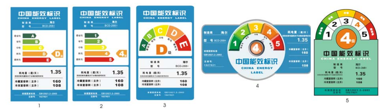
Figure 4. The final five label designs tested in the consumer survey

The final round of research involved testing five optimised labels, Figure 4, via an extensive and quantitative consumer survey. Labels 1 and 2 are superficially identical, but 2 uses numbers to rate efficiency in place of letters. With the exception of label 5 all labels had the same background colour and all used the same fonts, information and descriptive text adjacent to the efficiency grades. Despite this, the labels vary by: numbers or letters, dials or stacked bars, vertical or horizontal layout.