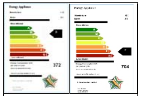
Figure 6. The South African energy label as tested in the in-person survey

The South African Department of Mines and Energy launched energy appliance labelling based on a European label design in May 2004. With this a priori decision taken, the program needed to know how to maximise consumers receptivity to the labels. Two consumer research tasks were implemented: a telephone survey and an in-person survey. The former focused on general questions regarding the appliance market, energy efficiency and the concept of appliance labelling. The latter focused on more specific questions—showing actual label designs to explore label comprehension, preferences and potential to motivate buying decisions. A side-by-side example of two models differing on energy was shown to facilitate a test of comprehension (Figure 6). See Surprenant et al (2005) for all methodological details.