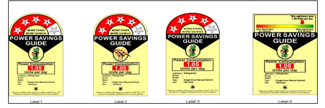
Figure 3. The four trial labels presented to the expert panel

Since the passage of the 2002 Energy Conservation Act (EC Act) the Bureau of Energy Efficiency (BEE) is responsible for Indian energy efficiency policy. Prior to this a draft energy label was developed via market research split into three phases conducted sequentially from 1997 to 2000 (Dethman et al 2000) involving: 1) a survey of the attitudes and reactions towards the concept of labelling and energy efficiency amongst a sample of 1833 major-appliance owners from 6 cities; 2) ten focus groups segregated by sex were conducted in three cities to design initial label formats using 11 designs based on international models pretested and a resulting in a final set of 17 potential labels; 3) expert consultation through a stakeholder focus group, that considered designs from the prior phases generated four label designs (Figure 3), which were subsequently tested in a simulated shopping environment with 673 appliance-owners in four cities.