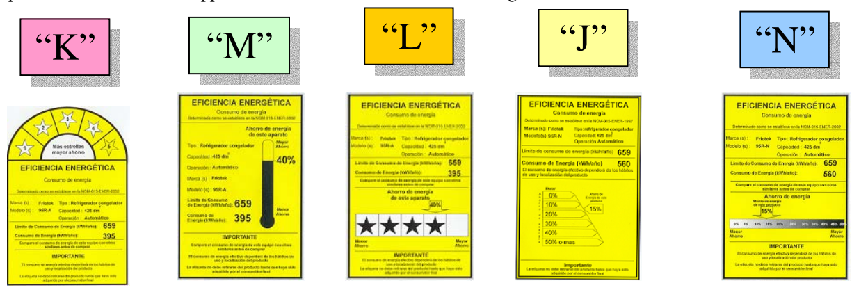
Figure 5.The five trial designs tested in the consumer focus groups

In 2002, CONAE the Mexican agency responsible for energy efficiency labelling since 1995, decided to undertake a revision of Mexico's label design. The decision was taken at the encouragement of manufacturers who suggested the label could be improved to give customers clearer signals on the efficiency level. CONAE undertook limited research prior to launch despite the fact that the new label would go into effect regardless of the results—as a check on its assumption that the new design would be better than the old and effective for Mexican consumers. Thus, it was hoped the study would confirm an a priori decision about the new label design. Any comprehension or other issues the research might bring to light would inform outreach campaigns and potential future revisions. In late 2002 a total of six focus groups were conducted (two each in Mexico City, Monterrey and Guadalajara) with recent appliance purchasers and current shoppers. All the labels tested are shown in Figure 5.